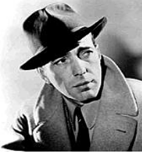
Ken Thornton-Smith © 2002

Episode 21: It's 11pm... Do you know where your pasta is?